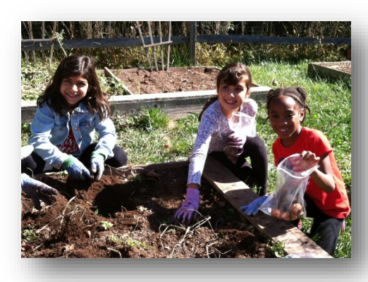
Farm-to-Table at our elementary schools!