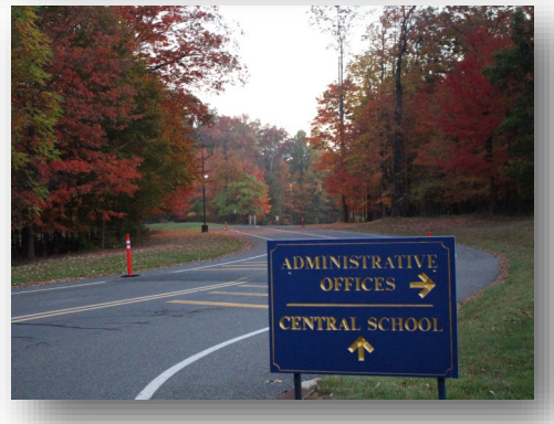
S P F L A E L N L D O R