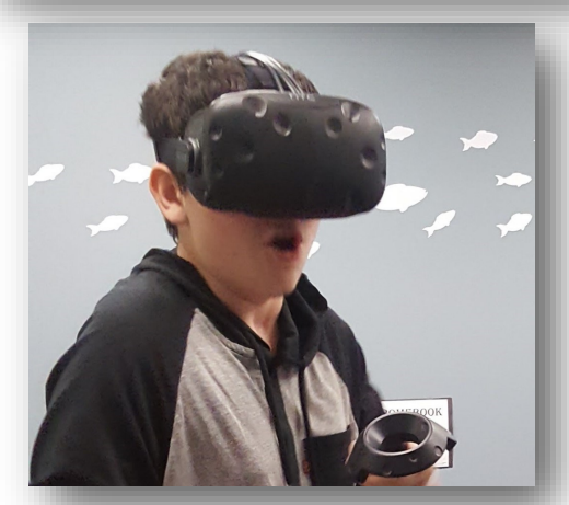
Virtual Reality at Middle School!